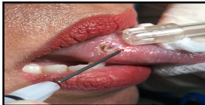
Figure 2. Laser is used to excise the mass

Excisional biopsy of the bluish mass is performed under local anaesthesia by using laser to control the bleeding (Figure 2). The excised specimen is then sent to the laboratory for histopathological examination to get the definitive diagnosis of this case. A post-treatment photograph is taken (Figure 3) for record purposes and the patient is advised to avoid eating spicy food, avoid consuming hot drink and avoid smoking for 1 hour after the treatment.