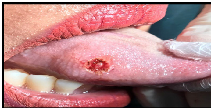
Figure 3. The tongue - after excision of the mass

Histopathological examination shows deposition of fine, irregular brownish black particles in the connective tissue adjacent to the epithelium (Figure 4a and 4b). No abnormal melanocytes or naevus cells