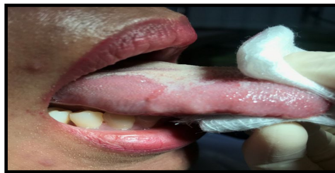
Figure 6. Signs of healing after at 1 month review