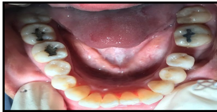
Figure 5. Presence of amalgam filling on adjacent teeth