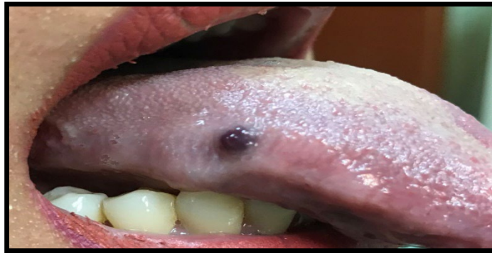
Figure 1. Pre-treatment photograph showing bluish black mass on the right lateral border of the tongue

Upon examination, the patient appears to be fit, has no underlying diseases and is not under any medications. She denied any systemic or infectious diseases. The pre-treatment photograph showed a single, smooth, and bluish coloured mass with the size of 3mm x 3mm on the mid right lateral border of the tongue (Figure 1). The lesion is not tender to palpation, not indurated and fluctuant. Blanching test was done and shows negative. Besides, there is no associated ulcer or lymphadenopathy found and, differential diagnosis of varix, melanotic macule and naevus are given. The patient wishes to have the lesion removed as it looks deformed and unsightly.